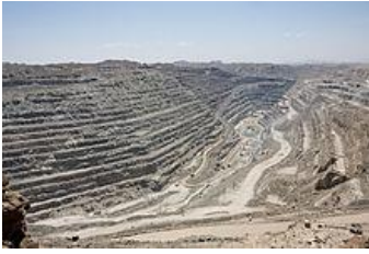
An open pit uranium mine in Namibia